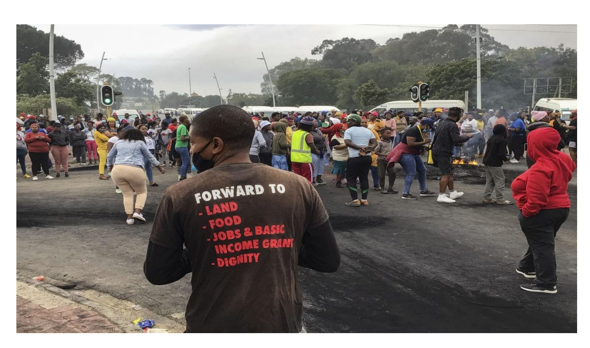
Shutdown of Makhanda in May 2021